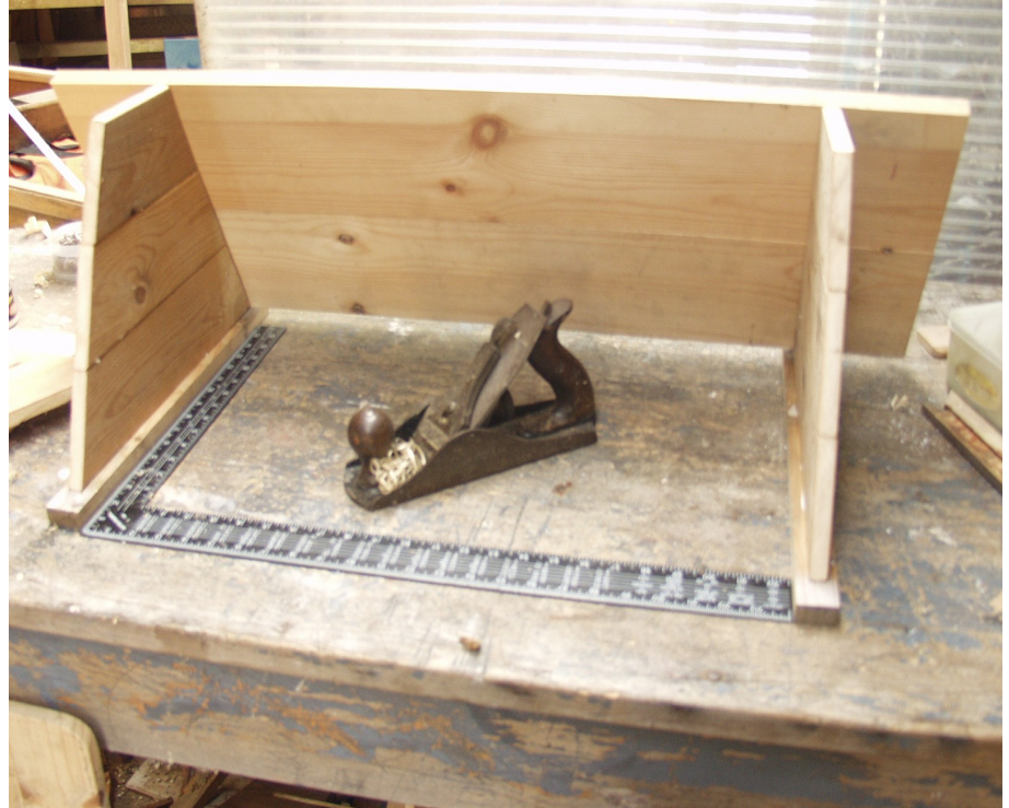
Position one of the side panels against the follower boards, resting on the top bars.