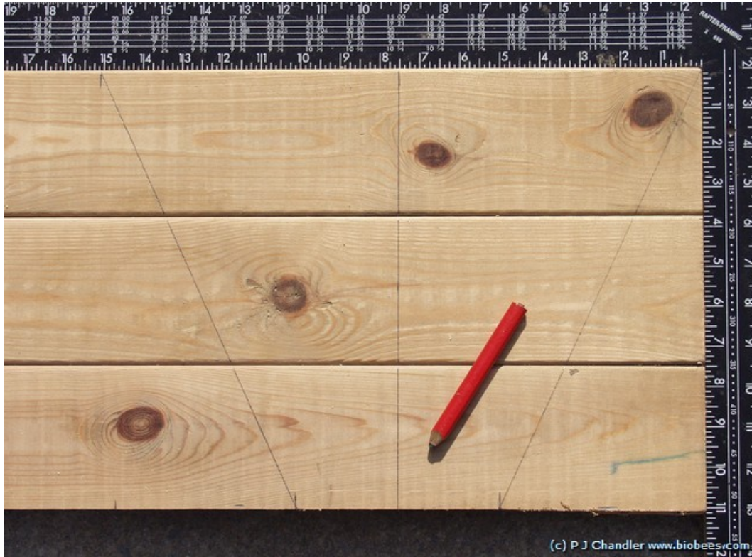
Join up the dots to make the trapezoidal shape of the follower boards