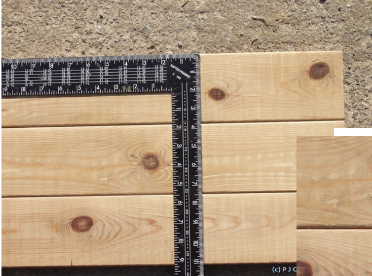
Draw a centre line to the bottom edge