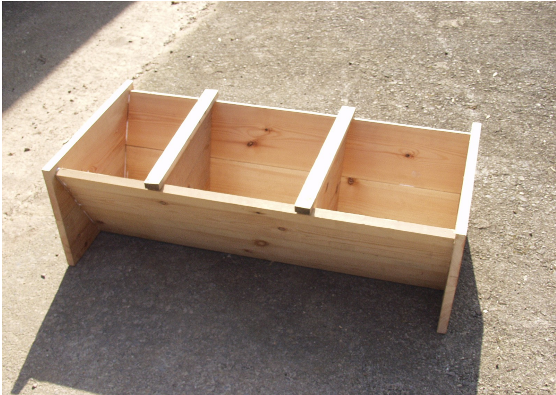
This is what your hive should look like now. The follower boards are a good, sliding fit and the whole thing looks sturdy ad almost ready for bees!