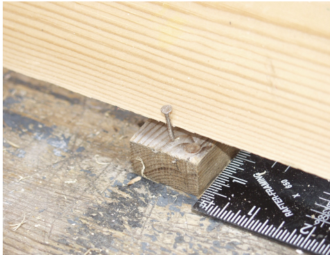
A small nail tapped into the top bar prevents the side panel from slipping off.

The hive is built upside down and inside out. The follower boards represent the 'inside' and now you are about to add the outer skin.