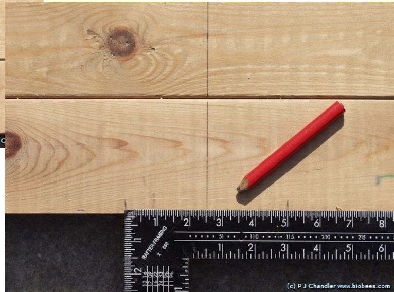
Mark 2.5 inches either side of centre on the bottom edge