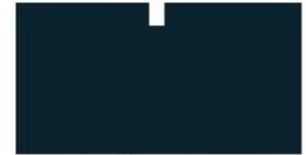
Top bar cross section

For this particular design, the top bars are 17" long, which seems to be a convenient length for both bees and beekeeper. Make them about 3/4" thick.