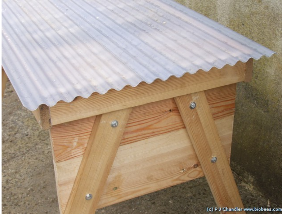
A simple roof using corrugated plastic, available from DIY stores.